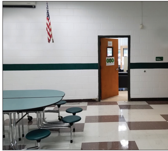
Located just off the cafeteria, the Pascack Valley Wellness Center is accessible from in the cafeteria and from an entrance to the left in the front of the school.

http://pascack.k12.nj.us (Pascack Valley/ Pascack Valley Wellness)